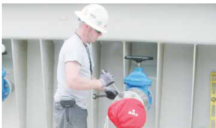
ABB transformer services ensure that your shell transformers operate at optimal performance throughout their lifetime. Our services range from transportation and basic maintenance to advanced diagnostic assessments and onsite repairs.