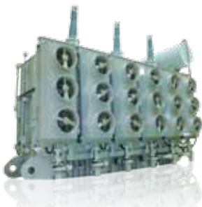
ABB has delivered several hundreds of shell transformers to some of the world's largest projects. Our shell transformers are renowned for their robustness and compact design based on proven technology.