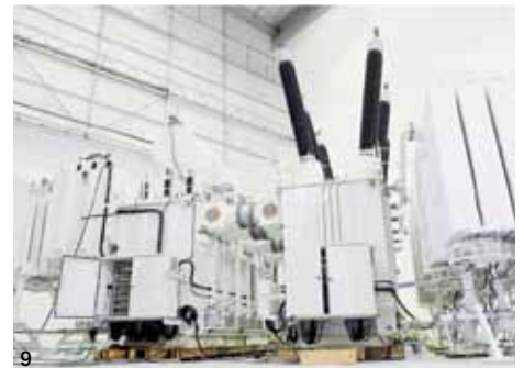
1. 400 kV, 500 MVA single phase generator transformer in operation in a Nuclear power plant | 2. Three phase 550 MVA generator transformer in a combined cycle power plant | 3. 400 kV, 570 MVA single phase generator transformer ready for installation in a Nuclear power plant | 4. 600 MVA bank of 400 kV single phase autotransformers at the substation | 5. 1120 MVA bank of 500 MVA autotransformers at the substation | 6. 800 MVA three phase 345 kV autotransformer during factory testing | 7. Multivoltage polytransformer at the substation | 8. Fast deployable 400 kV mobile transformers in operation | 9. Phase shifter 750 MVA, 230 kV, \pm 30^\circ during factory testing