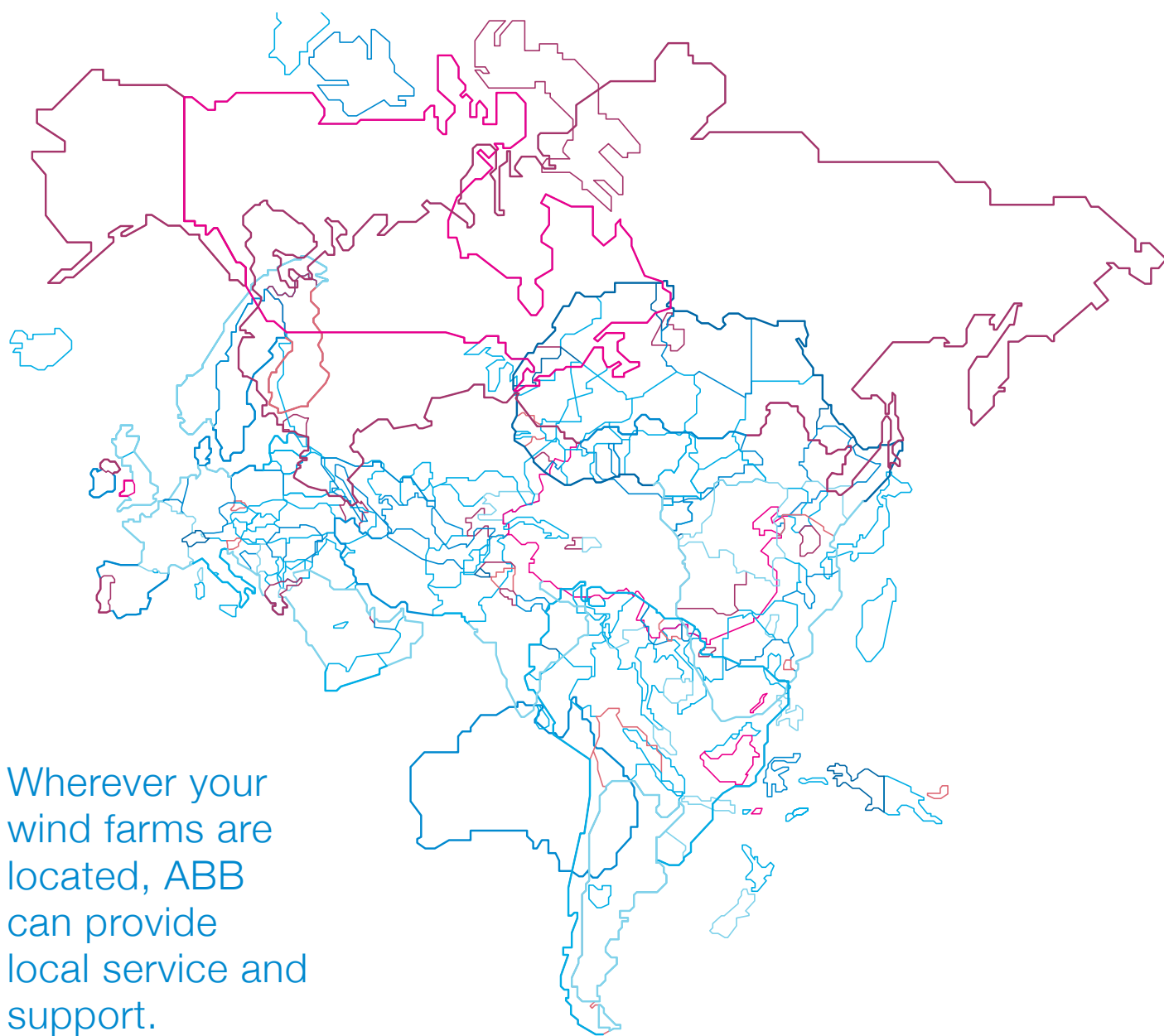
ABB has repair workshops in all parts of the world, with local service centers in all major wind power countries. ABB workshops can perform a wide range of repair services for ABB and many other brands of wind power generators.

Wherever your wind farms are located, ABB can provide local service and support.