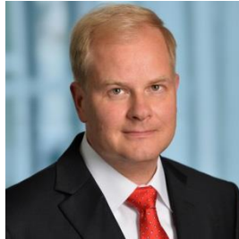
Pekka Tiitinen Discrete Automation and Motion