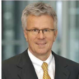
Bernhard Jucker Power Products