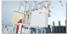
Australia iron ore mining