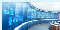
Logistics control tower in China