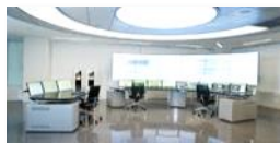
South Africa water pumping station