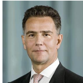
Brice Koch Power Systems