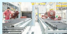
Shared manufacturing in Brazil