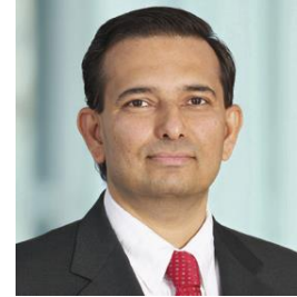
Tarak Mehta Low Voltage Products