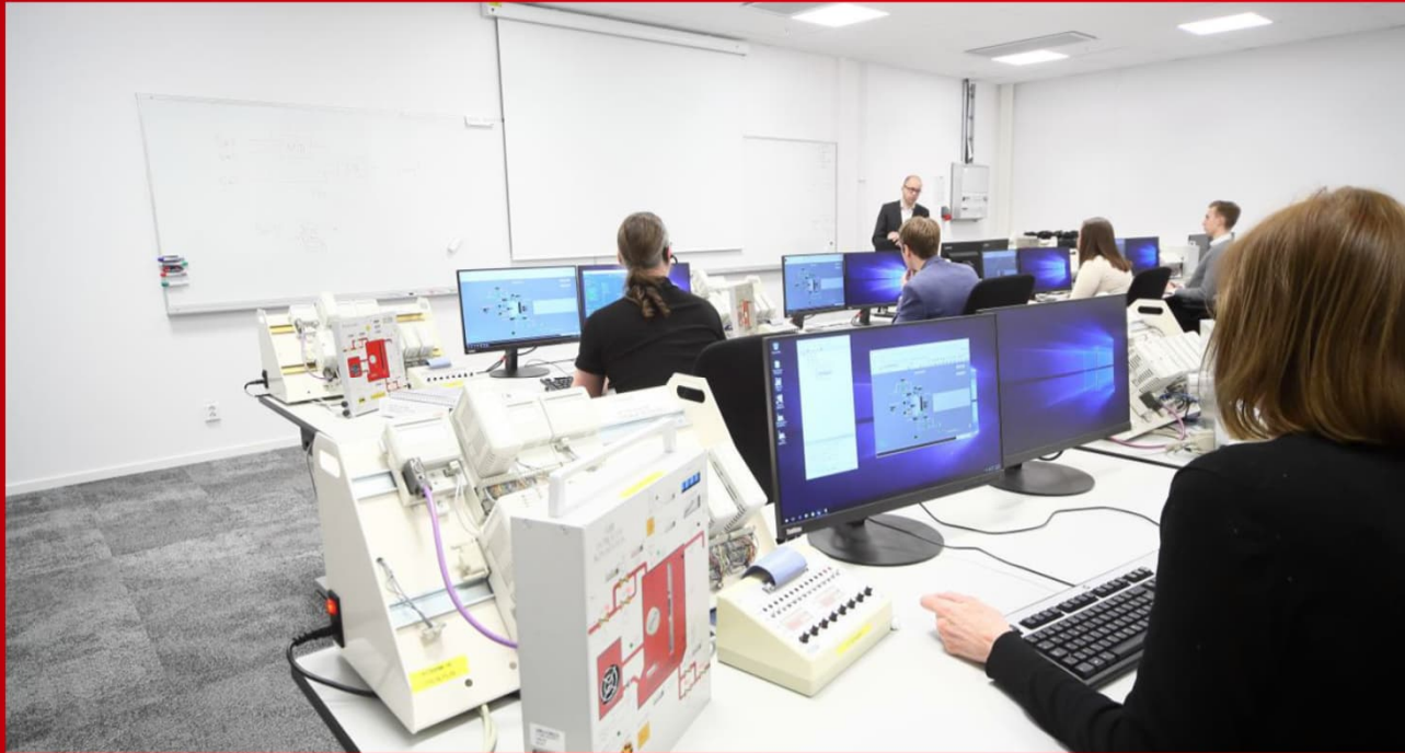
ABB Training Center, Västerås Classroom and online training, January – June 2025