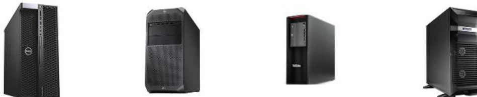
Dell Premium T5820XL