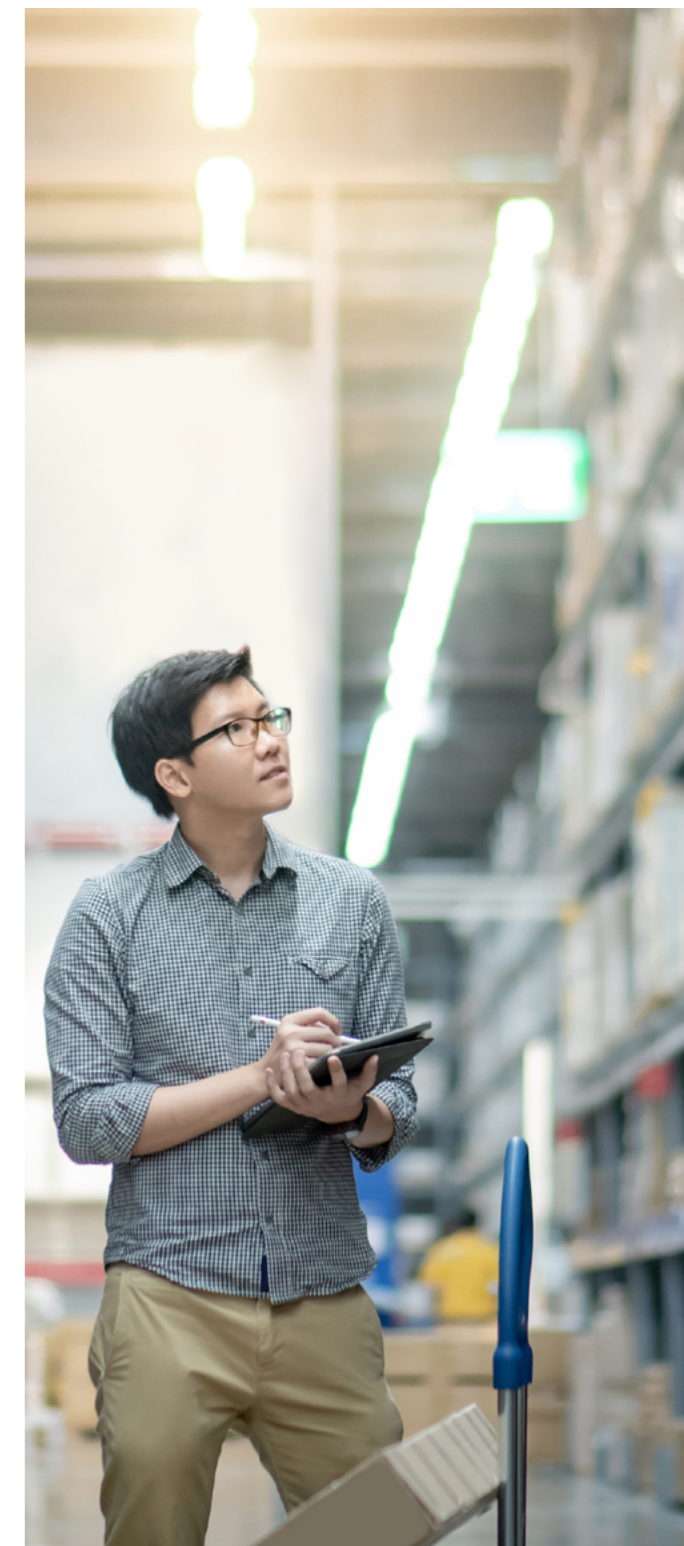
ABB reserves the right to conduct audits together with you at your sub-supplier (ABB tier 2) sites.

We encourage you to include diversity in your supplier base.