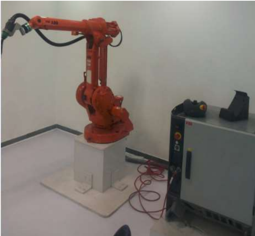
ABB Model IRB1410 With IRC5 Controller Robot on pedestal Welding Torch and multiple type of TCP