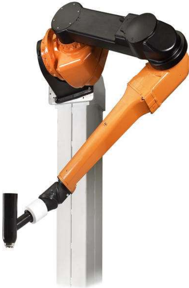
ABB Model IRB 5400 With IRC5P Controller Paint Robot for Process Training Along with Dry Air and Simulation Software