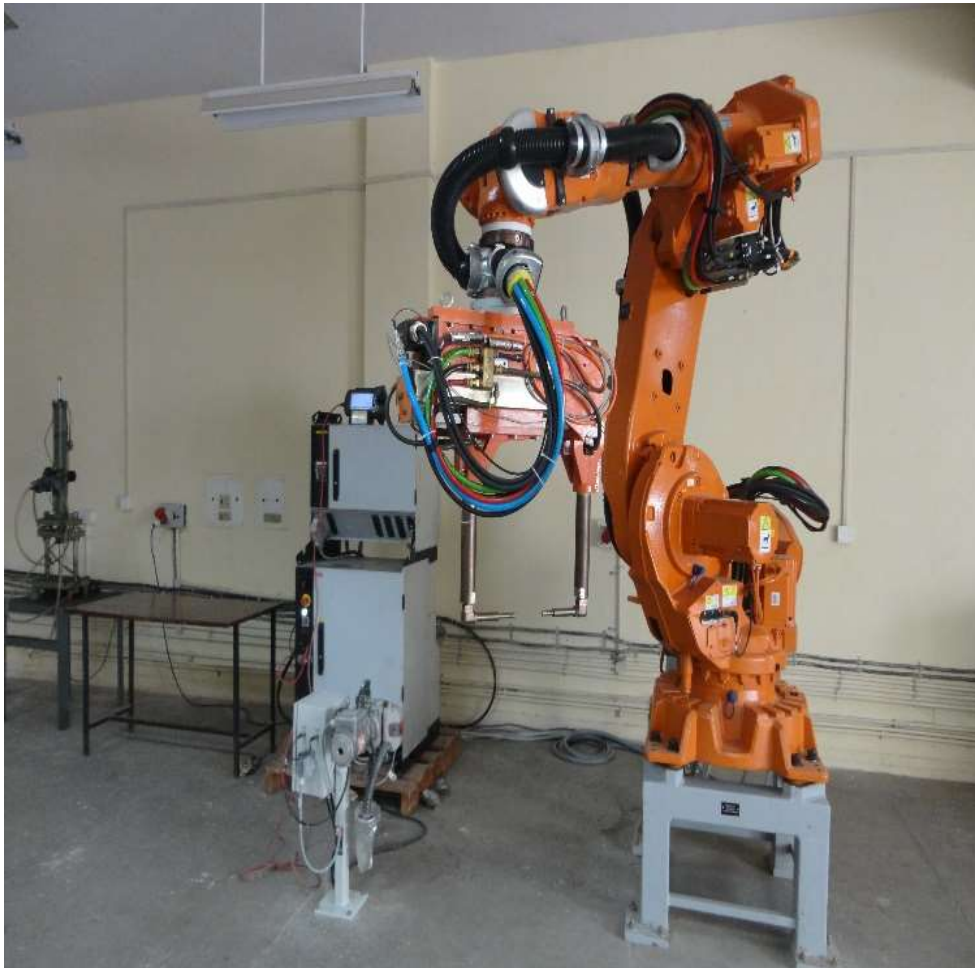
ABB Model IRB 6640 With IRC5 Controller Robot on pedestal Full demo for Spot Welding Application Trial

Bosch PST 610E, Integrated 95 kVA Thyrsitor capacity, 400V to 480V, 50/60Hz, 130A (rated), Air cooled