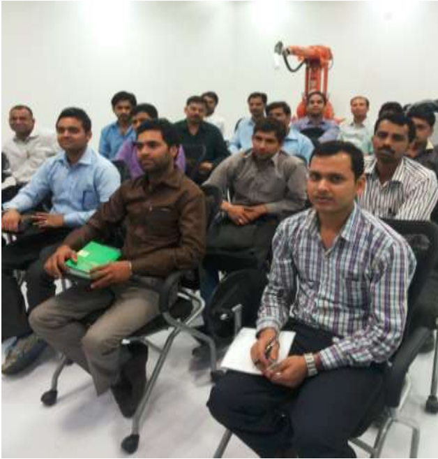
Demo Room Simulation