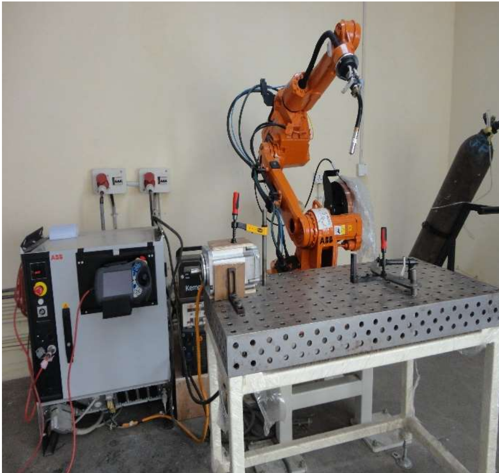
ABB Model IRB1520 With IRC5 Controller Robot on pedestal Full demo for Welding Application Trial Welding Power Source Keparc 400 Welding Torch and multiple type of TCP