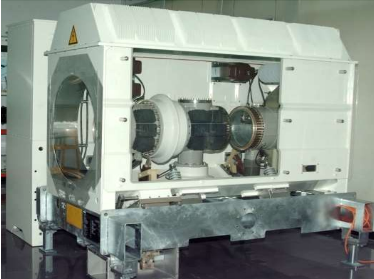
Generator Circuit Breaker – Type HECS -130L