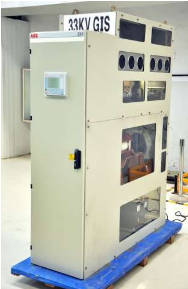
33kV Gas Insulated Switchgear - Type ZX2