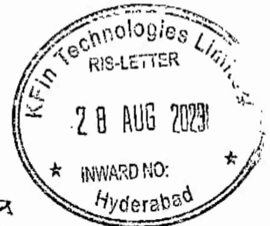
Yvette Olga De Souza