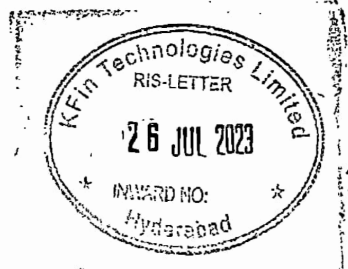
HANSA SHAH 2 nd holder