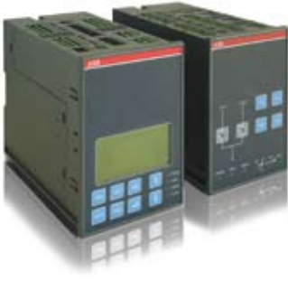
ABB presents the new generation of Automatic Transfer Switch, the result of a worldwide experience on low voltage applications.

The new generation of ATS family – ATS021 and ATS022 offers the most advanced and comprehensive solution in power continuity.