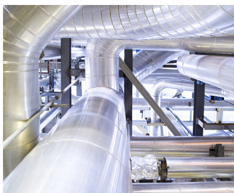
ABB recommends a periodic review of the A and B factors. Other factors for such a review would be: the cost of energy ( C_e and C_{em} ); the effective loading (L); and, the discount rate (i).

where E_p (tons/Wh) characterizes total emissions, calculated from the known quantity of emissions for each of the pollutants while producing a certain amount of electricity, and E_c (USD/ton) is the market value for the pollutants.