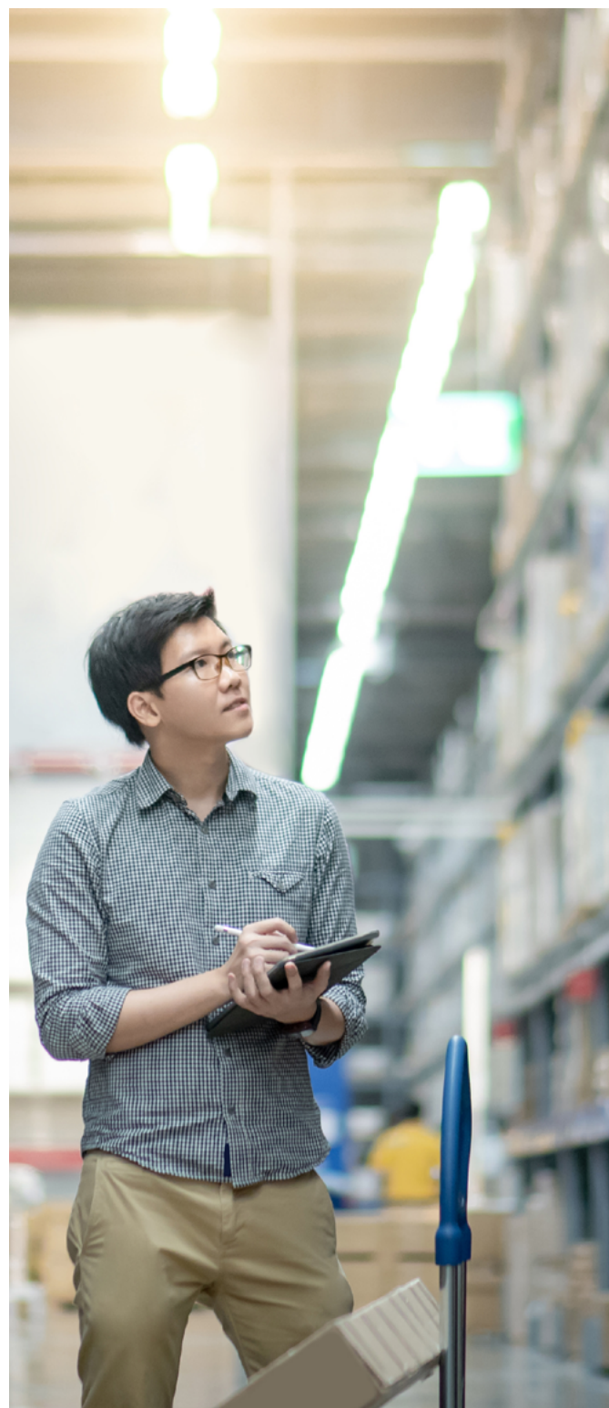
ABB reserves the right to conduct audits together with you at your sub-supplier (ABB tier 2) sites.

We encourage you to include diversity in your supplier base.