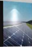
ABB Solutions for Renewable Energy

Welcome to ABB at Solar Energy Southeast Asia 2014