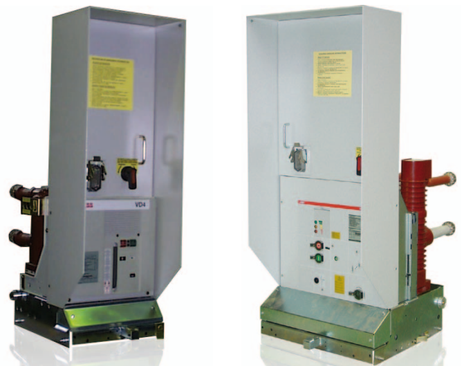
VD4-DR vacuum and HD4-DR gas retrofit

DIARC data label referred to MVA fault power and open-air rated current and therefore shall be converted to kA and in-panel capacity for complying with today standards.