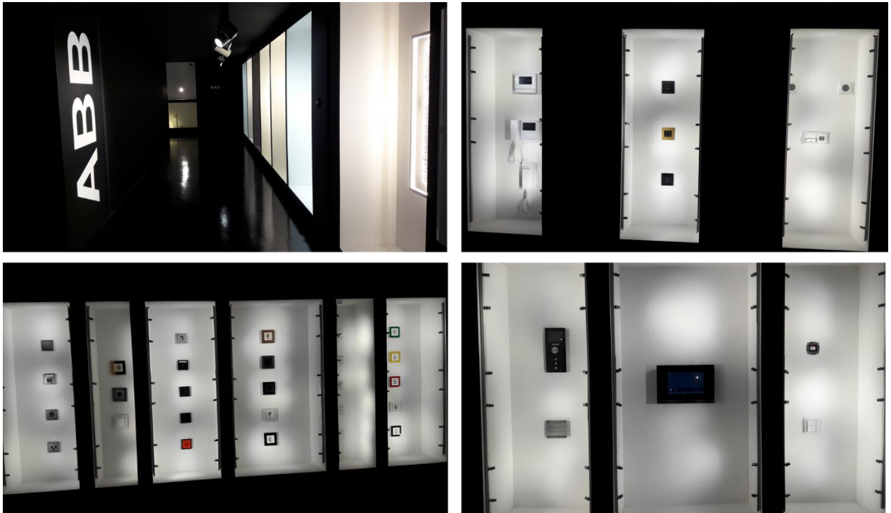
Picture: ABB section in Unilux's showroom, displaying ABB products and solutions for buildings. Image Courtesy of SOMA Architects.

Moreover, this showroom not only showcases ABB building products, but it also embraces ABB's KNX building automation technology. The whole Unilux's showroom and office spaces are fully controlled and automated using ABB i-bus KNX actuators and sensors. More than 200 KNX devices are installed to offer a full control of each luminaire installed in the showroom. Not only KNX systems, the showroom also showcases ABB's door entry systems which is integrated with other systems, incl. wiring devices in the showroom.